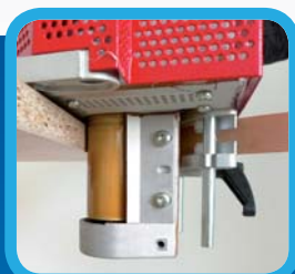
GLUE APPLICATION TO BOARD