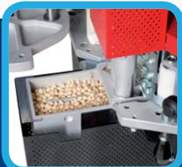
GLUE POT CAPACITY 450 G