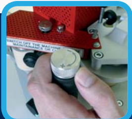
STEPLESS SPEED CONTROLLER