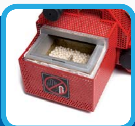
GLUE POT CAPACITY 450 G